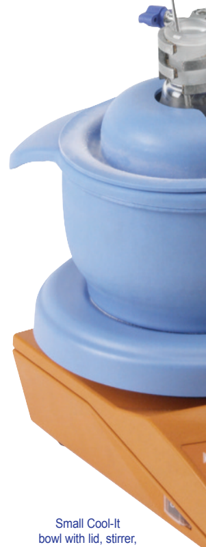
Small Cool-It bowl with lid, stirrer, stand and digital thermometer